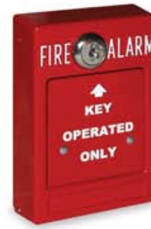
RMS ( ) KO