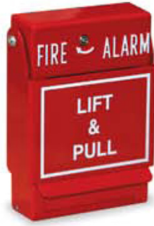
RMS ( ) LP