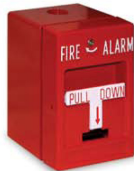
RMS ( ) WP