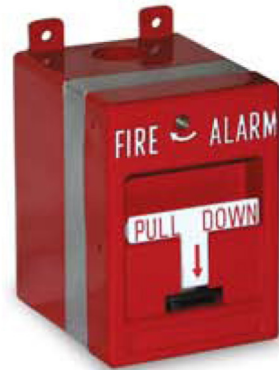
RMS-EXP ( )