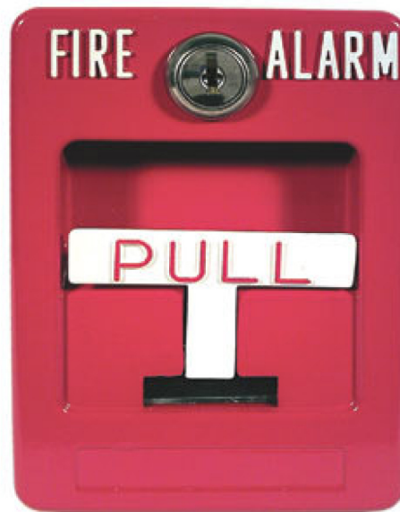
MODEL SP-1 (SINGLE POLE) MODEL SP-2 (DOUBLE POLE)